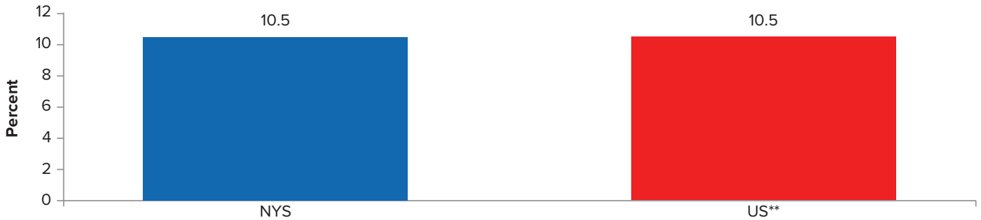
Figure 1. Diabetes* among US and New York State adults, BRFSS 2016

*Does not include reported gestational diabetes, prediabetes, or borderline diabetes.