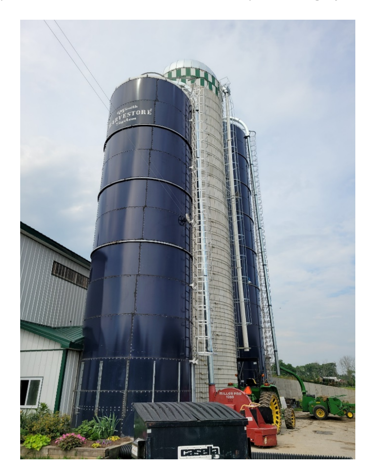
Photo 1. An 11-year-old farm youth was fatally injured by a sweep auger inside the silo that is in the foreground.