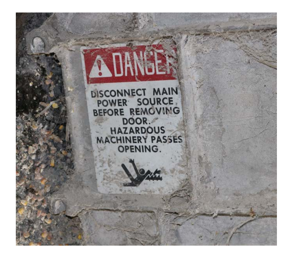
Photo 5. The warning sign on the silo hatch door requires that all operators disconnect the main power source before working near the unloader (Courtesy of NYCAMH/NEC).