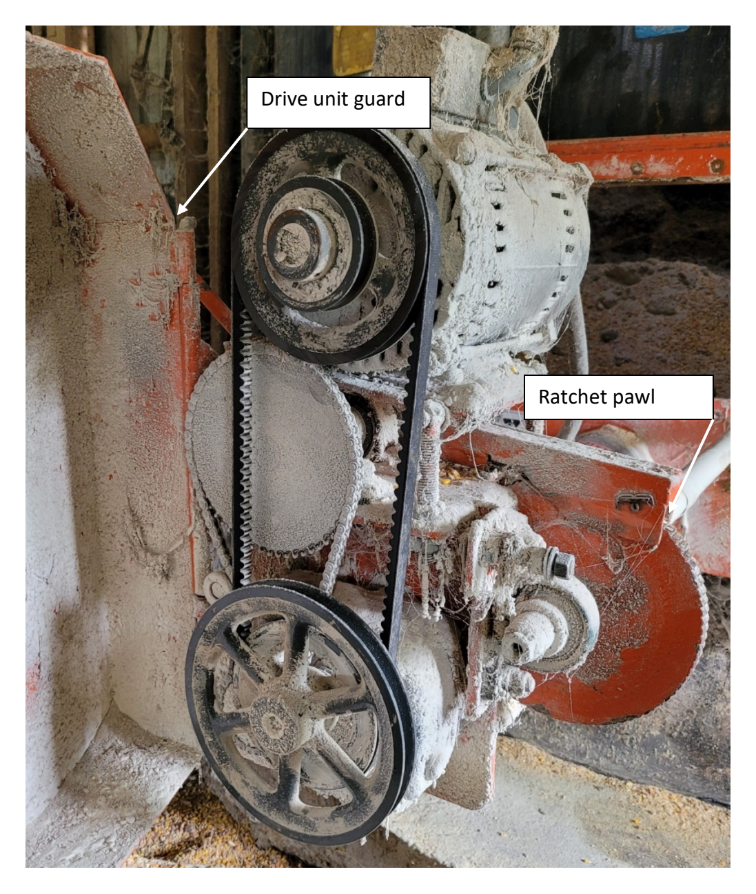
Photo 2. The unloader drive unit that has an electric motor (3 horsepower 208v) and a pulley. It also has a ratchet mechanism that drives the sweep auger drive shaft.