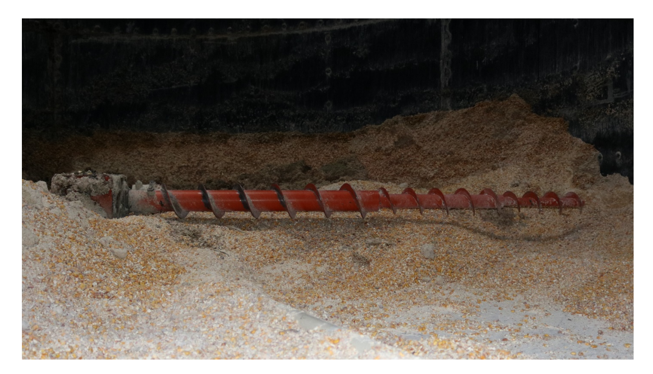
Photo 3. The unguarded sweep auger was mounted in the gearbox 8 inches above the silo floor.

Figure 2. The ratcheting gear mechanism that drives the sweep auger drive shaft (Valmetal Owner's Manual).