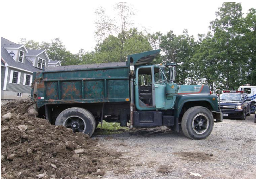
Photo 1. The dump truck that crushed the victim at the residential construction site.

The dump truck was purchased by the victim from a private owner between 2000 and 2001, and had been solely maintained by the victim since that time. It was a 1969 six-wheel, dual-axle truck equipped with a 13-cubic yard dump body (Photo 1). The truck had 110,332 miles. The safety inspection of the truck required by the New York State Department of Motor Vehicles (NYS DMV) expired on May 2008, two months before the incident.