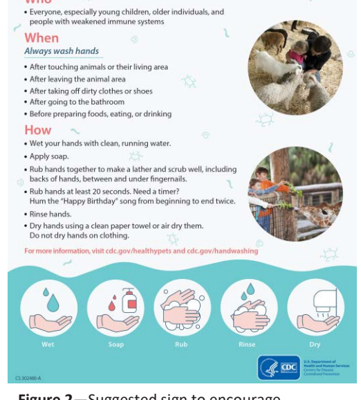
Figure 2 —Suggested sign to encourage compliance with handwashing procedures as a means of reducing the possible spread of infectious disease. <sup>[252]</sup>