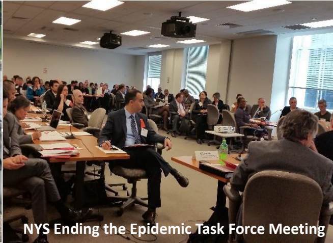
NYS Ending the Epidemic Task Force Meeting