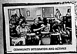
COMMUNITY INTEGRATION AND ACTIVITIES

RELIGIOUS SERVICES AND ACCOMMODATIONS ARE ALWAYS AVAILABLE. PLEASE SEE YOUR RECREATIONAL LEADER.