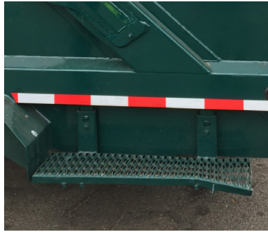
Photo 4. Fifteen months after the fatal incident, the refuse collection truck that was involved in the incident was painted and fitted with a new compactor. The bent step was still not repaired (Courtesy of PESH).