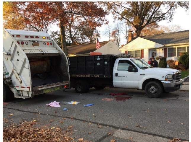
Photo 3. The victim was crushed against the lawn service truck while riding the refuse collection truck on the right riding step when the refuse collection truck was backing up.