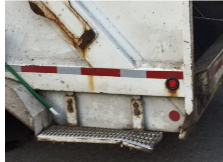
Photo 2. The warning sign on the refuse collection truck was faded with illegible wording.

According to the maintenance records, the truck was inspected, maintained, and repaired a total of 22 times in 2018 prior to the fatal incident in November. Lights, horn, brakes, wipers, mirrors, tires, and tire pressure were regularly checked and repaired. A complete engine service was done in September. The maintenance department also replaced batteries, and changed air, fuel, oil, and carbon filters. There was no documentation showing that the riding steps were ever inspected. The bent step was not reported, nor was a repair scheduled.