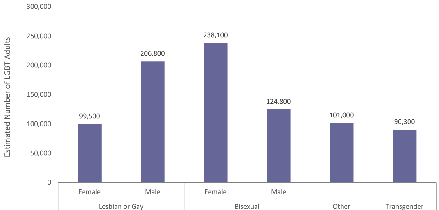
Figure 1. Estimated Number of Adults Who Self-Identify as Lesbian, Gay, Bisexual, Other Sexual Orientation, or Transgender in NYS, BRFSS 2014-2016*