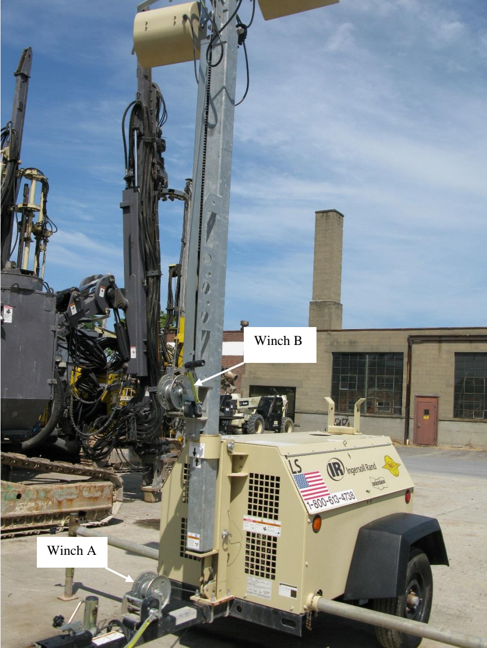
Photo 2. A Doosan mobile light tower Model LightSource, the same model as the one in the incident.

On the morning of the incident, the owner of the paving company called the victim and asked him to return the light towers to the rental company. At approximately 7:30 am, the victim arrived at the site and started taking down the light towers and returning them one at a time in a company pickup. By 9:20 am, he had returned three light towers and started taking down the fourth.