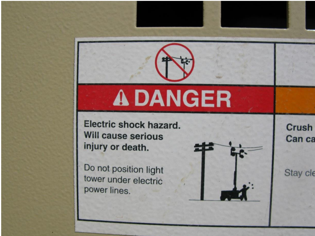
Photo 3. A manufacturer’s sticker on the Doosan light tower warned of the electric shock hazard associated with positioning a light tower under powerlines.

The mobile light tower was manufactured by Doosan Ingersoll Rand (Model: LightSource) and powered by a 4.6L diesel engine (Photo 2). The fuel capacity of the engine was 27 gallons (102 liters) and would allow lighting to be maintained for up to 52 hours. The light tower had four 1,000-watt metal halide lamps mounted on a telescoping mast made of galvanized steel. The telescopic mast could extend to 30 feet high with a 360° rotation and could be locked in position. The manufacturer stated in the Operating & Maintenance Manual: “ Danger: DO NOT raise or position light tower under electrical powerlines ”. There was a sticker on the tower warning the users of the electric shock hazard associated with positioning the light tower under powerlines (Photo 3).