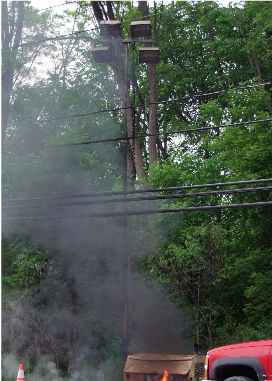
Photo 1. The mobile tower contacted a 7,620-volt powerline causing a fire and an explosion at the road construction site